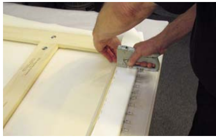
10. The canvas is secured with staples on the reverse.

I realize that many of you at this point are non-believers, thinking, "I've always stretched from the centers outward, that's the way it's always been done. Besides, it is too many steps and I don't think it could make that much