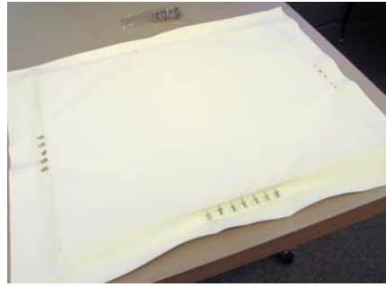
2b. Stretching and pinning continues from the centers outward.