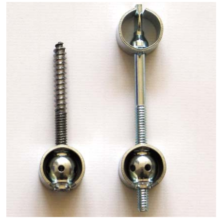
Left: Hanger bolt with Knap & Vogt® ball Right: Complete Knap & Vogt® Tite Joint Fastener

Custom made strainers can be extremely strong if they are joined together with dowel pins, corner triangles and lap-jointed crossbars screwed together on both sides. The strongest stretcher bars are fabricated from two pieces of wood: the lip and bar. This system creates a stretcher bar having the increased strength of an I-beam. Stretcher bars milled from one piece of wood will not resist bowing. Stretcher bars fabricated like an