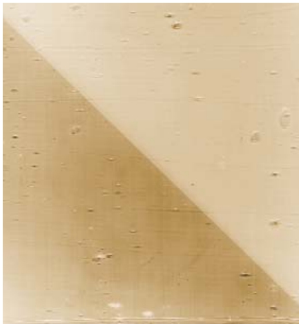
SID: Support Induced Discoloration. Discolored water miscible impurities migrate from the support through the ground and become trapped in the acrylic film as seen in half of this image. The other half has a ground / size combination that blocks the migration.

Grounds may or may not block SID from occurring. Many grounds do not. The use of a size such as GAC 100 will help