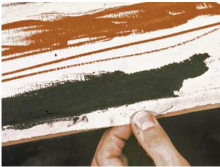
5. Insufficient tack margin allowance makes stretching very difficult.

• Next, draw weave indication lines to assist stretching accuracy. Lay the point of the well-sharpened pencil in the groove of the weave at one of the corner marks, and draw a continuous line that follows the weave, extending to the corresponding other side. Often times, the weave has a distinct curve to it and the line indicating the weave will not line-up with the equivalent mark by the time one gets across the fabric, being off an inch or two. It is the true line of the weave we wish to follow. I often draw a second line one-quarter inch in (or out, if the first line is way off base) from the first line, so that I may observe parallelism and any inaccuracy very quickly. My preference is to have the lines inside the outer marks, so that the lines remain visible on the front of the canvas as I perform the stretching (face up). If the plan is to stretch with the fabric face down, the lines will need to be outside the perimeter marks, so that they may be observed on the sides of the stretcher.