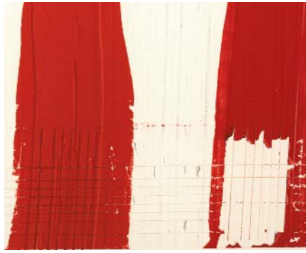
Cross Hatch Adhesion Test - Right: Oil paint is easily removed from a smooth ground. Left: Oil paint is adhered well to a toothy ground.

An acrylic's capacity to carry pigment and filler solids is technically referred to as pigment volume concentration (PVC). As a category, acrylics provide a wide range of PVC. Some acrylics have higher PVC tolerances than others. How much and what type of solids are loaded into the acrylic directly influences attributes like tooth, sheen, opacity, color and flexibility. While the artist will likely never think about PVC as an attribute, it is an important concept to understand related to other binders such as oil and alkyds, which carry solids differently, resulting in different attributes and performance when compared to acrylics.