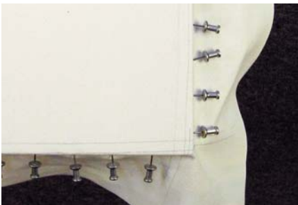
3. Corners cannot be pulled into place due to overall restriction of fabric.

The most often used method for stretching has been to mark the canvas centers (top, bottom left and right), stretch and tack the center points, and then to proceed stretching, working from the centers outward. Some artists do this a few tacks at a time, moving onwards to opposite locations, until reaching the outer corners. Other artists will tack a half a side at a time, working from the centers outward, and rotating a quarter turn at a time, as if making a pinwheel. All techniques that restrict the center body of the fabric, leaving the outer regions until last, guarantee an unsatisfactory stretching dynamic. The central threads are locked in place at the outset. As stretching and tacking continue, the fabric is resistant to respond as it is restricted in the middle and can only be stretched in the region