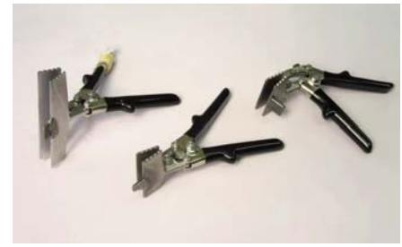
11. Stretcher pliers provide grip and pulling leverage.

Fingers and hands are unable to grab onto canvas and pull with the strength that well designed stretcher pliers are able to. Pliers come in a variety of types but