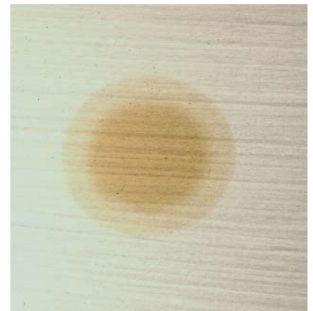
Linseed oil absorption into ground layer facilitates adhesion to an acrylic gesso or ground.

Acrylic Dispersion Grounds, like all grounds are formulated to provide enough absorption to allow some level of penetration of paint to promote adhesion as well as allowing the artist to begin her process with washes if so desired. Absorption and adhesion are related because the physical penetration of the binder-rich acrylic paint into the substrate or ground provides good anchoring of the acrylic. More importantly, when using oil paints, the absorption needs to allow enough linseed oil to penetrate without starving the paint layers of the vital binding oil. When employing washes, standard grounds provide enough absorption to allow a fair amount of wash and layering.