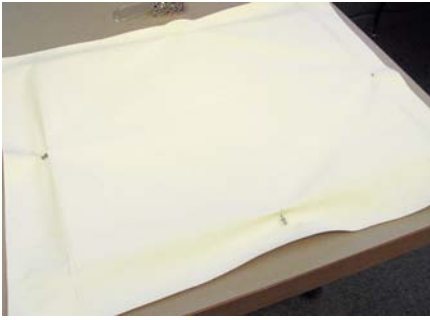
2a. Traditional stretching: the centers are marked and aligned.