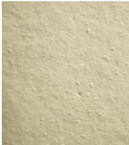
Consistent surface and tooth of a well made acrylic gesso.

The focus of the Acrylic Dispersion Ground quality standard is to identify and assure the most critical attributes for a ground are met. The attributes mentioned earlier are all considered in the testing and development of a quality method. Standard development is a process, which takes time. The testing and work is carefully conducted and repeated to assure purposeful accuracy. The subcommittee is required to vote for ultimate approval of the standard