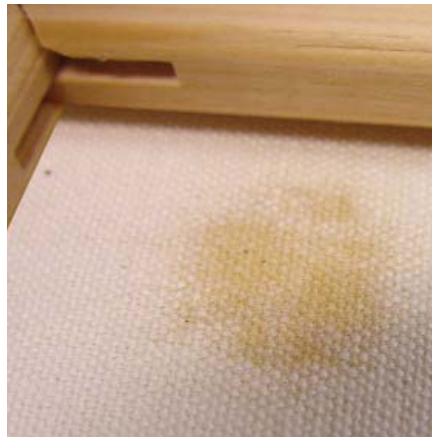
Oil is seen here staining right through the back of a poorly prepared dispersion ground.

reduce the affects of SID. GOLDEN Technical Support suggests the use of GAC 100 as a size for cotton and wood substrates followed by a minimum of three coats of White Gesso. If the substrate is suspected of being highly concentrated with water miscible components such as questionable grades of cotton duck canvas, hardboards and certain species of wood, additional coats are recommended. It is also possible to pre-wash cotton or linen to dramatically reduce the yellowing affects of SID.