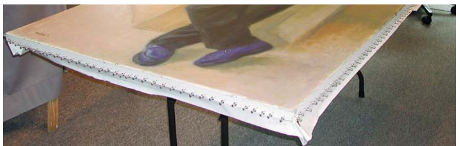
8. Painting stretched face up and pinned.

What does happen however is that, once entirely pinned, the parallel reference lines adhere to their parallelism throughout. More importantly, the canvas now exhibits an unrivalled suspension, uniform in tension, on the order of a trampoline. (Image 8) This can be observed if the stretched canvas is stood along its long side and if a strong tamp is made with the hand at one end of the canvas. This will create a wave which may be observed to follow clear across the canvas and then, like ripples in the water, this wave will echo back and return to the sender. This phenomenon will not occur with a painting stretched from the centers outward because differentials in canvas tension will absorb and stop the wave movement. Awesome, huh?