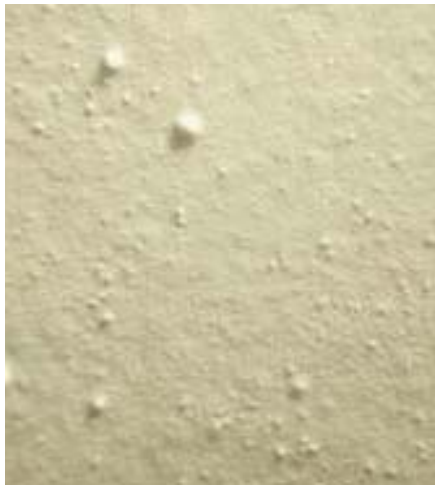
Random surface quality due to inconsistent particle size of pigment solids.

language for these materials and a minimum level of performance. These documents prescribe test methods to assure desired quality attributes are achieved for a particular product or family of products. The American Standardization of Tests and Materials International (ASTM) is a standard development and writing organization in which Golden Artist Colors participates.