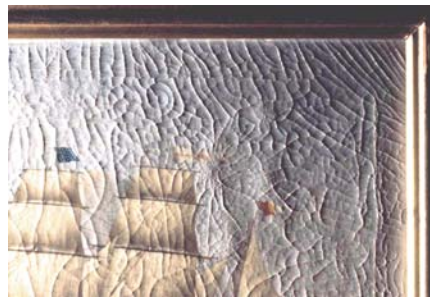
4. Classic stretching tension crack patterns on 19th century painting.

Then, imagine the painting becoming slack at some point, especially in the soft middle. When corner joins are expanded by keying by an eighth to quarter of an inch, a tremendous tension is produced in this short distance across the join. This same eighth to quarter of an inch width is insignificant across the much larger distance of the canvas middle. Thus, in order to bring up a soft belly, an extreme amount of keying has to take place at the corners where additional tension can barely be withstood. No wonder painting canvases often break at the corners and paint forms classic mechanical crack patterns traversing the corners. (Image 4)