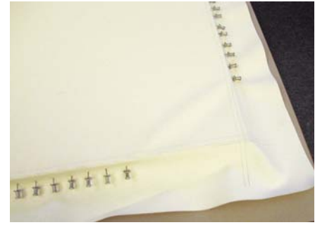
2c. Locked central passages limit corner stretching.

actual fabric stretching. There are numerous fine points that contribute to first-rate canvas preparation. Due to space limitation, I will confine this discussion to the stretching procedure itself. I then encourage artists to explore the additional materials and references offered at the close of the article (see: “ Canvas Stretching Resources ,” page 5). Additionally, go to goldenpaints.com homepage for “Information Sheets.”