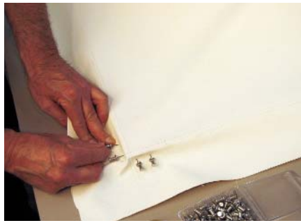
6. Set each of the corners with two pins per side.

Drawing pencil lines of the weave is usually easier in one direction than the other; the latter weave direction can be trickier to follow and the pencil may wish to jump threads, not following an easy straight line. Please note, it is