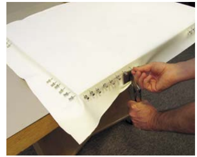
7. Continue stretching from corners inward, pulling with pliers and setting with pins. Centers remain unrestricted until the end.

Place the fabric on the stretcher and line up the parallel pencil lines with the outer wood bead. If reluctant to totally abandon the center point marks, you may temporarily set the canvas with pushpins in the stretcher sides at each of these points. Now set the four corners of the fabric, placing push pins (See Note 1) along the outsides of the stretcher to the immediate left & right of each corner. Prejudge as best possible the tension anticipated when all the pins would be in place. Now remove the center pins, leaving the entire middle of the canvas free, as this would have restrictive effect upon the canvas during stretching. Starting from the corners, use the canvas pliers (See Note 2) to gradually coax and stretch the fabric. Avoid fast, forceful movements; these could break the priming or threads. Secure margin with pins, advancing two or three pins at a time. (Image 6) Keep moving to opposite locations and continue stretching from the corners inward, bringing up no location